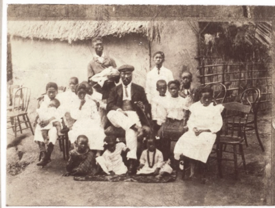
KING PREMPEH WITH HIS FAMILY IN EXILE

"What religion is the King of England?" Immediately the Anglican clergyman replied he belongs to my Church. "Oh", said Prempeh, "I am of opinion that all kings should have the same religion, therefore I accept the Church of England and am willing to attend same".