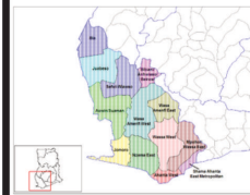
LOCATION OF SEFWI

Out in rural Ghana, far from any major population centre, a small group of Ghanaians stop work on Shabbat, refrain from eating pork, circumcise their newborn sons and adhere to the laws of ritual purity.