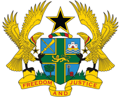
COAT OF ARMS OF GHANA SHOWING THE LION ON THE CROSS SURROUNDED BY TWO EAGLES

Psalm 78:5-6 "For he established a testimony in Jacob, and appointed a law in Israel, which he commanded our fathers, that they should make them known to their children: That the generation to come might know them, even the children which should be born; who should arise and declare them to their children:"